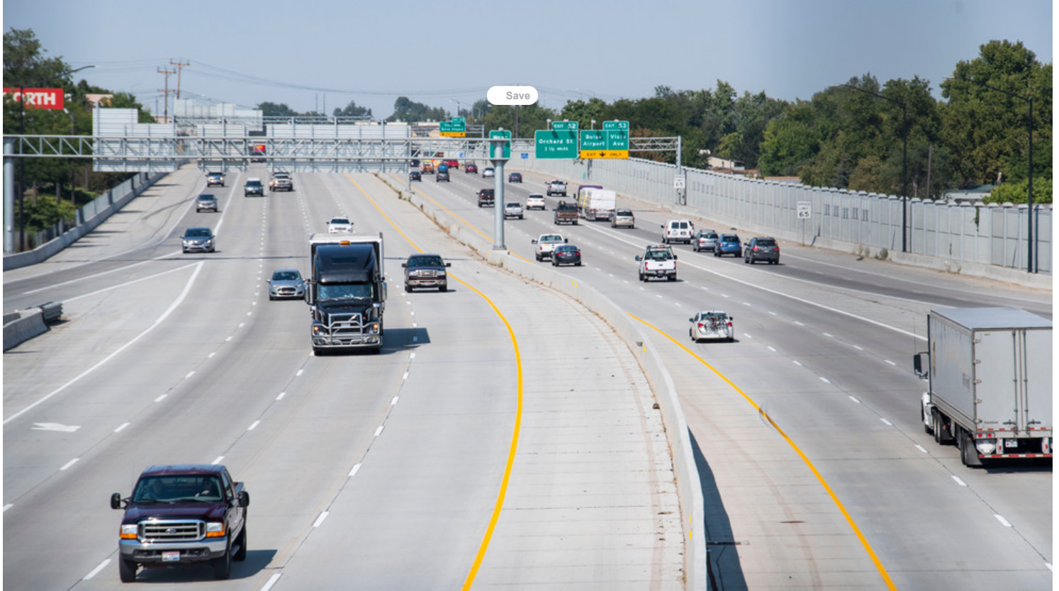
Broadway Overpass in Boise. (CBS2)

BOISE, Idaho (CBS2) — Would you like to see a high-capacity transit service, maybe a light-rail or rapid bus between Caldwell and Boise?