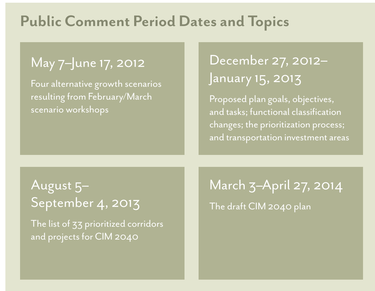
Figure 2.1. CIM 2040 public participation opportunities

This chapter will focus on the ongoing outreach, the scenario planning workshops, and the four public comment periods.