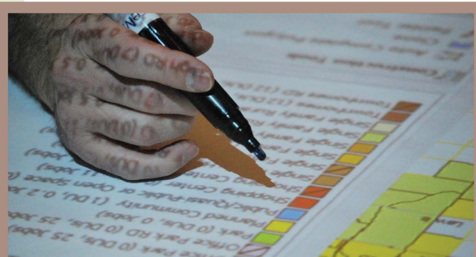
A CIM 2040 scenario planning workshop participant explores effects of growth in the Treasure Valley.

The workshops yielded 27 distinct future growth scenarios . Results from the workshops were distilled to develop four alternative scenarios submitted for public comment. 2 More information on the workshops and the scenario planning process can be found in Chapter 3.