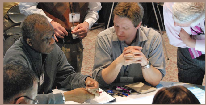
CIM 2040 scenario planning workshops.

To help remove barriers to attendance, COMPASS offered reimbursement for childcare costs, language translation and Spanish-speaking facilitators, and transportation assistance to participants.