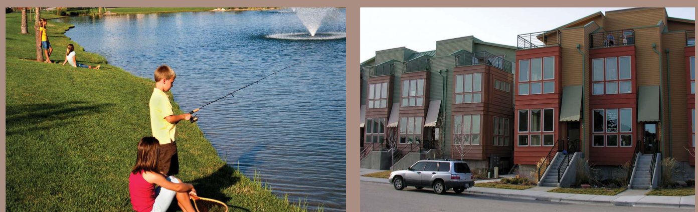
(L) Children fish in a pond within Meridian's Paramount subdivision. (R) Units in the Waterfront District along the Boise River in Garden City. Both were submitted as part of the Your Treasure Valley Future Photo Challenge.

From December 2012 through November 2013, residents submitted photos that represent values, ideals, and other aspects of Ada and Canyon Counties that they would like to see carried into the year 2040 or changed for the better. Several of these photos are used throughout this document to illustrate the future through the lenses of those who live here. Visit the COMPASS website or Facebook page to view all of the submitted photos.