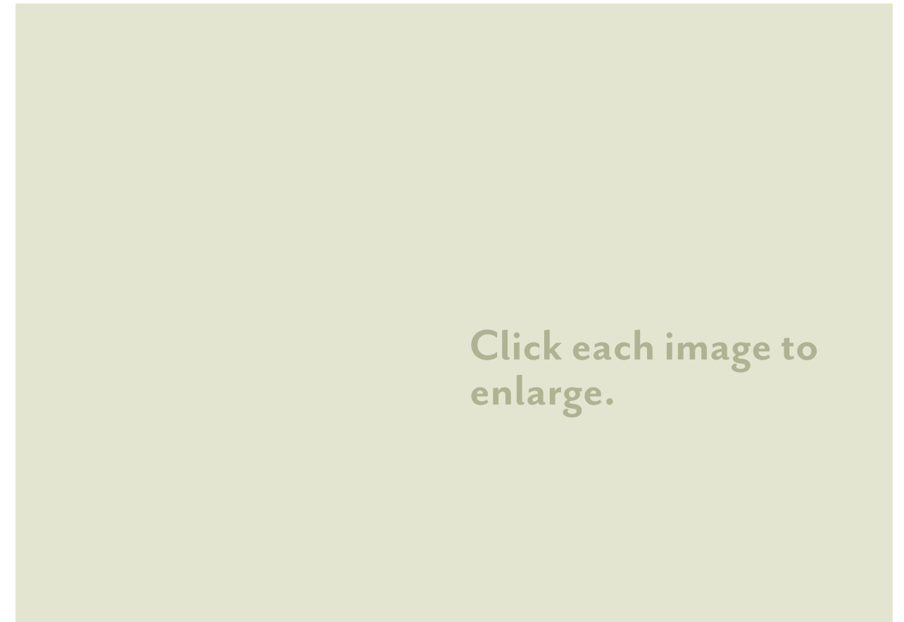
Figure 2.2. Youth art contest winners